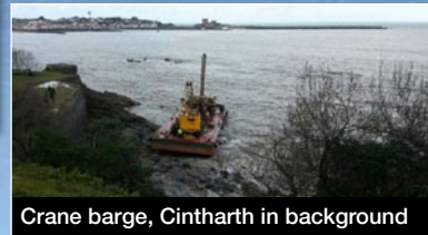
Crane barge, Cintharth in background