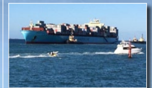
Further casualties overleaf ▽

Type of Claim Possible salvage type claim