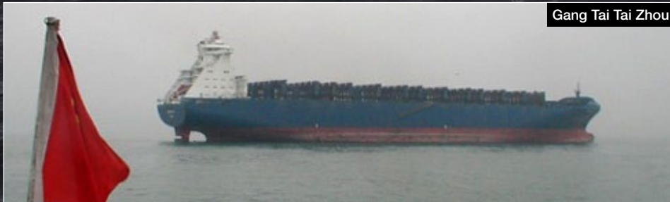
Gang Tai Tai Zhou

As a result of the damages sustained in collision the Tao Yuan began taking on water and soon developed a serious list of 30°. The Beihai Rescue Bureau dispatched its rescue vessel Beihaijiu 199 to the collision site and assisted in the rescue of the Tao Yuan 's 22 man crew. Shortly after the evacuation the 500 teu Tao Yuan sank. The larger boxship Gang Tai Tai Zhou , which is owned by Chinese Breakers, was reported to have only sustained minor damage to her bow. She remained at the scene and later anchored at Tianjin Port. The Beihaijiu 199 stood by the accident site and monitored the clean-up operation.